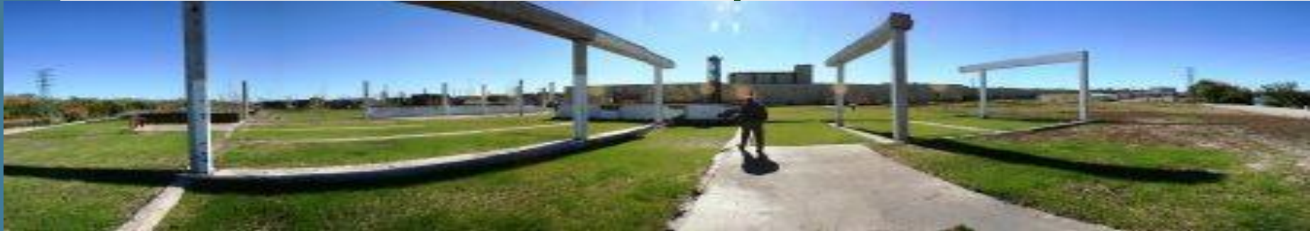
Former Midway Oil Company in Rock Island, IL cleaned up with Brownfields Grant

Up to $200K per property to fund the cleanup at no more than 3 sites.