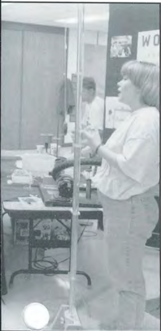
of Wierd Science, demonstrate ME department.