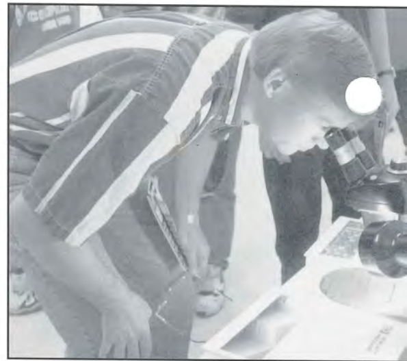
Left, a crowd fills the atrium of Durland Hall to visit see booth presented by student organizations. Above, a guest stops by electrical and computer engineering to view a display of a map of conductor paths on an Intel 486 wafer presented by the Integrated Circuits Engineering class.